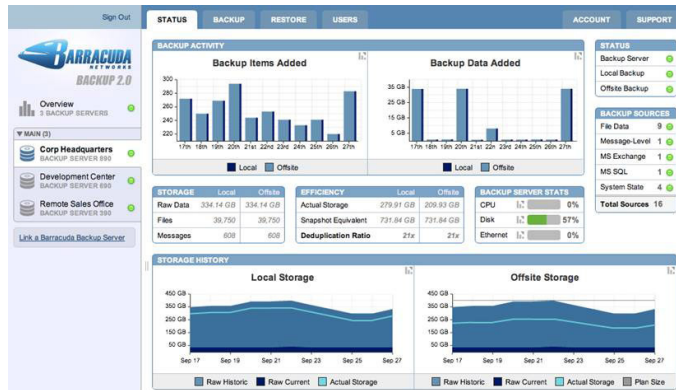
The Barracuda Backup Service Web Interface provides access and displays backup data usage and allows quick restoration of files.

Designed for organizations of various size and need, the Barracuda Backup Server maintains a local copy of data and efficiently transfers the data offsite without placing additional burden on production servers. Offsite cloud storage at Barracuda Networks is monitored and managed by Barracuda Central as part of the monthly Barracuda Backup Subscription. In the event that all data backed up is not equally business critical, the Barracuda Backup Service makes it easy to select the data that needs to be stored offsite for disaster recovery. The Barracuda Backup Service includes technical support and emergency assistance with restores in the event of a system failure or disaster.